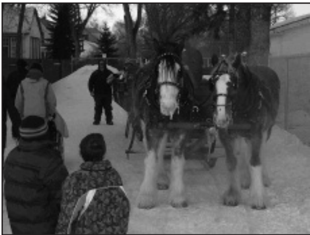
All ages waited to board the Western Development Museum Sleigh Rides

Despite cold temperatures, over 200 people attended Caswell Hill's first winter carnival at Caswell Community School and the Saskatoon Convalescent Home the evening of Friday, March 6, 2009.