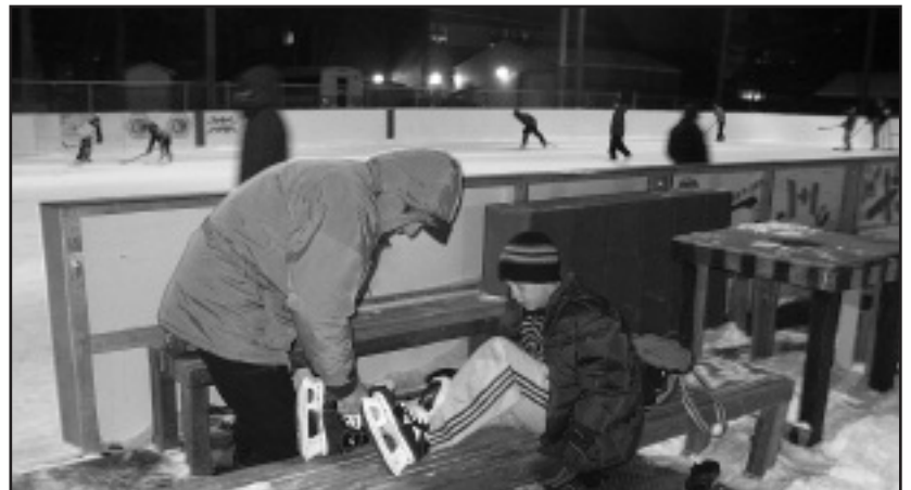
Skaters enjoyed the new lights on the rink

A big thanks to the Western Development Museum, the Me Ta We Tan Travelling Program, the SaskTel Mendel Art Caravan, Mayfair Hardware, Bedford Road Collegiate cheerleaders, Caswell Community School, the Saskatoon Convalescent Home, community volunteers, and all the people who came out to make this event a success!