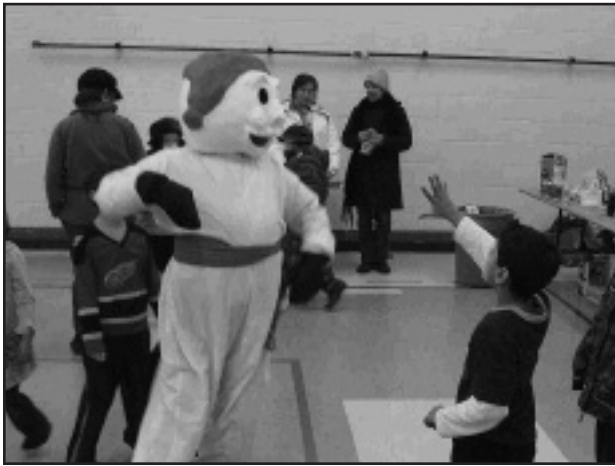
Le Bonhomme Carnaval danced in the school gym