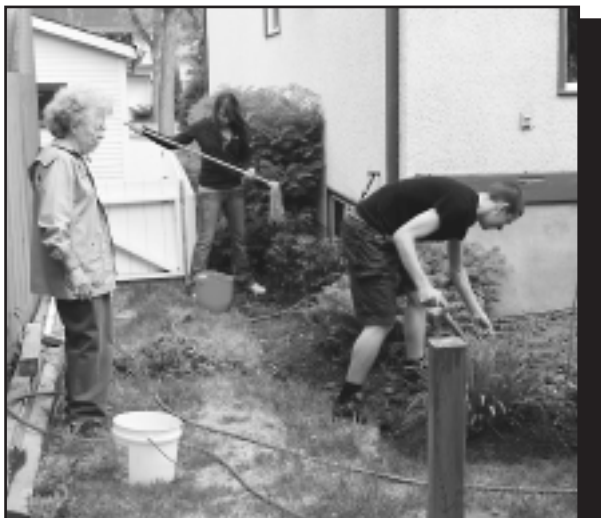
"Bedford Road Students Working Hard in the Garden"

If you are interested in volunteering for the Adopt-a-Grandparent program, or if you are a senior who would like to sign up for services provided, please call Wilma at 664-2330.