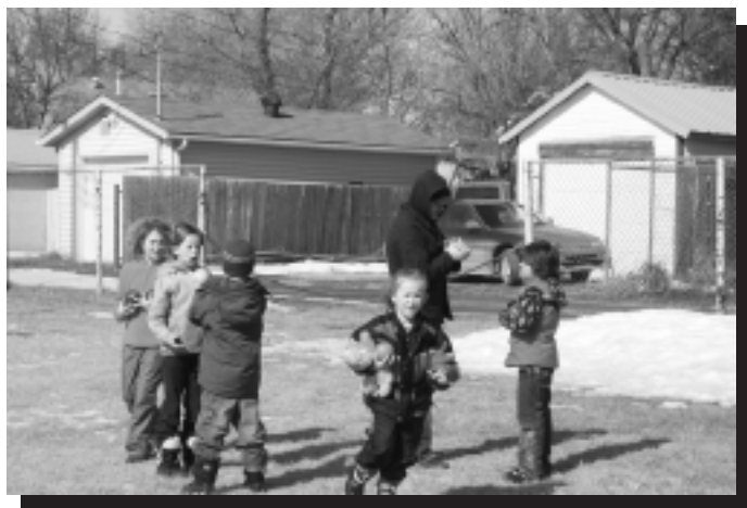
Kid's Snow Bocce

Scotiabank TJ's Pizza To the Nines Tree Turning the Tide Vaganza's