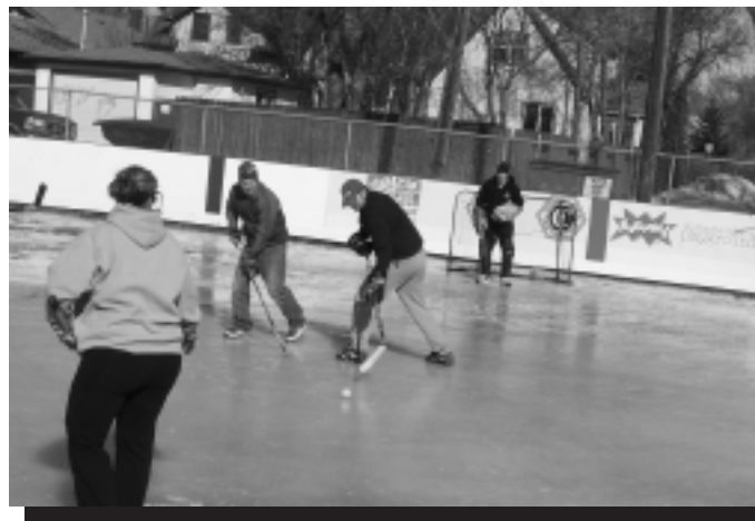
Go Teacher's Pets!!!!