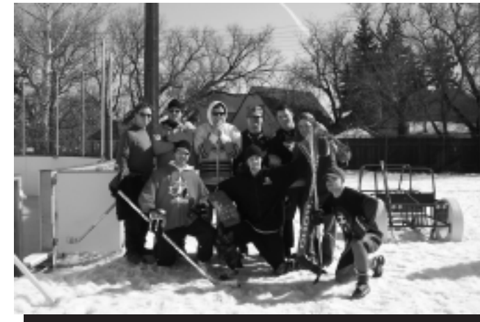
The Shankster's took home the trophy

For Lover's Only Kanine Klippers Keo's Restaurant KFC Konga Cafe Mayfair Drugs